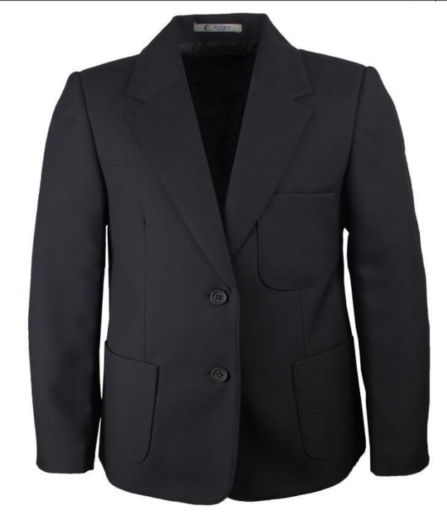
Blazer- Black (For Winter)